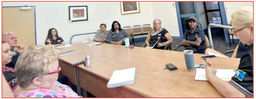
A well-attended Pormpuraaw Stakeholders meeting was held at the Justice Centre on Friday 21 February.