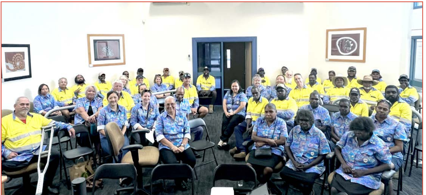
Pormpuraaw Aboriginal Shire Council's staff "Getting to Know You and Wellbeing Forum" which was launched with all of us wearing our 'Funky Friday' shirts. Page 2 pics: The teams' did some great work towards setting new standards in and around our workplaces.