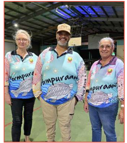
Family fun in Pormpuraaw: bonfire, tug o' war; table tennis, pool, Big Pups...and a good cause (below)