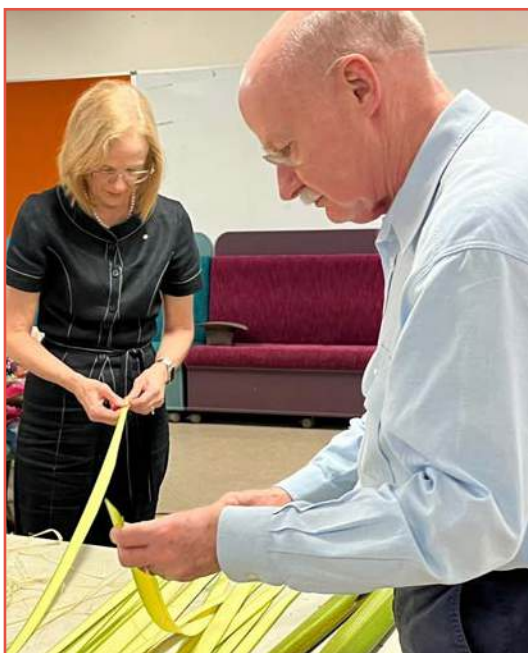
Governor and Professor making grass skirts & farewelling the Governor.