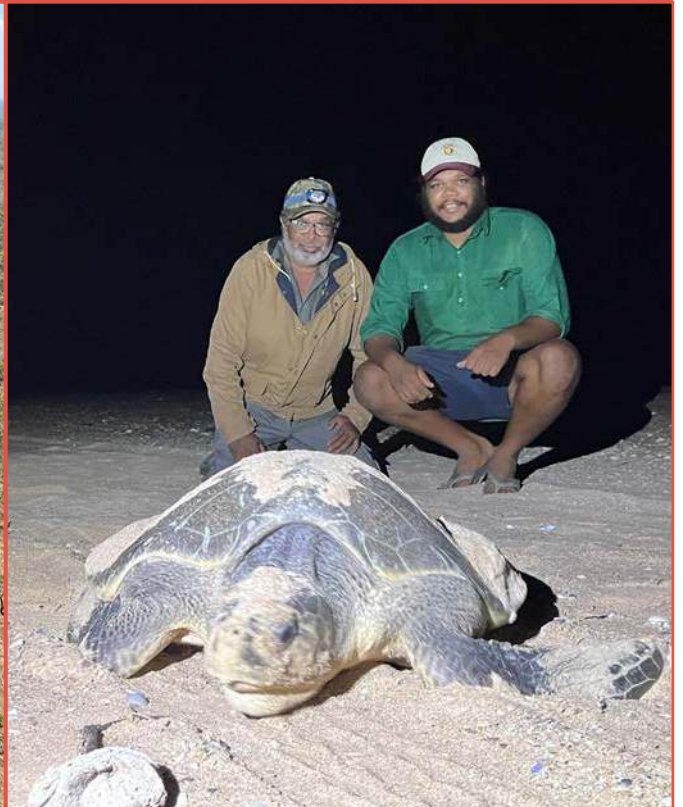
Top & Left: aerial views of Pormpuraaw and carbon burning from the helicopter.