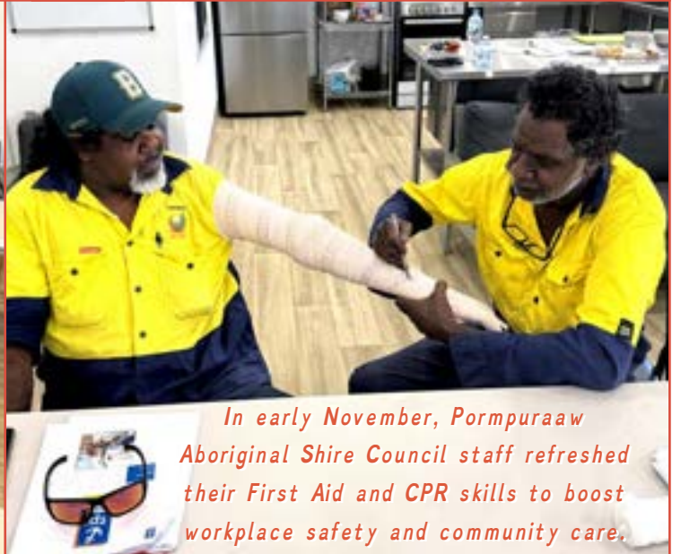
In early November, Pormpuraaw Aboriginal Shire Council staff refreshed their First Aid and CPR skills to boost workplace safety and community care.